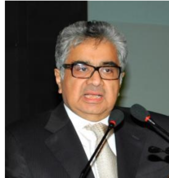
Mr Harish N Salve Senior Advocate Supreme Court National Conference on Integrity- 18 th January, 2011

“The nation is happy to live in lie, deceit and dishonesty and we have all chosen to become hypocrites”.